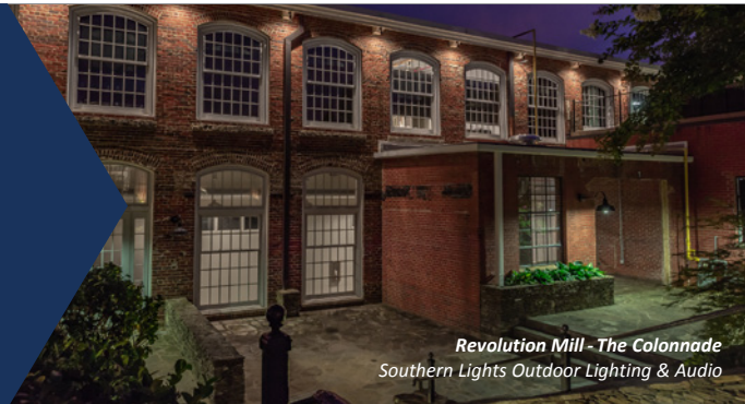
Revolution Mill - The Colonnade Southern Lights Outdoor Lighting & Audio

Lighting installation designed to enhance the overall landscape and architecture of the commercial property.