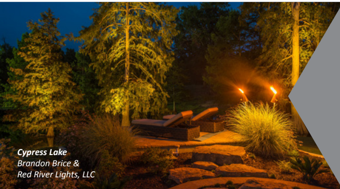
Cypress Lake Brandon Brice & Red River Lights, LLC