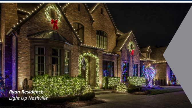
Ryan Residence Light Up Nashville