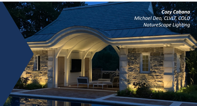
Cozy Cabana Michael Deo, CLVLT, COLD NatureScape Lighting

Lighting installation in any area in the built environment where people entertain or “live” outside, such as a patio, deck, covered terrace, outdoor kitchen, fireplace (or fire pit) area or dining area (spaces that are not part of the general planted landscape).