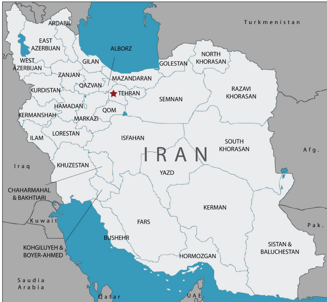
Figure 2. Map of Iran