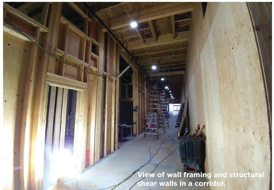
View of wall framing and structural shear walls in a corridor.