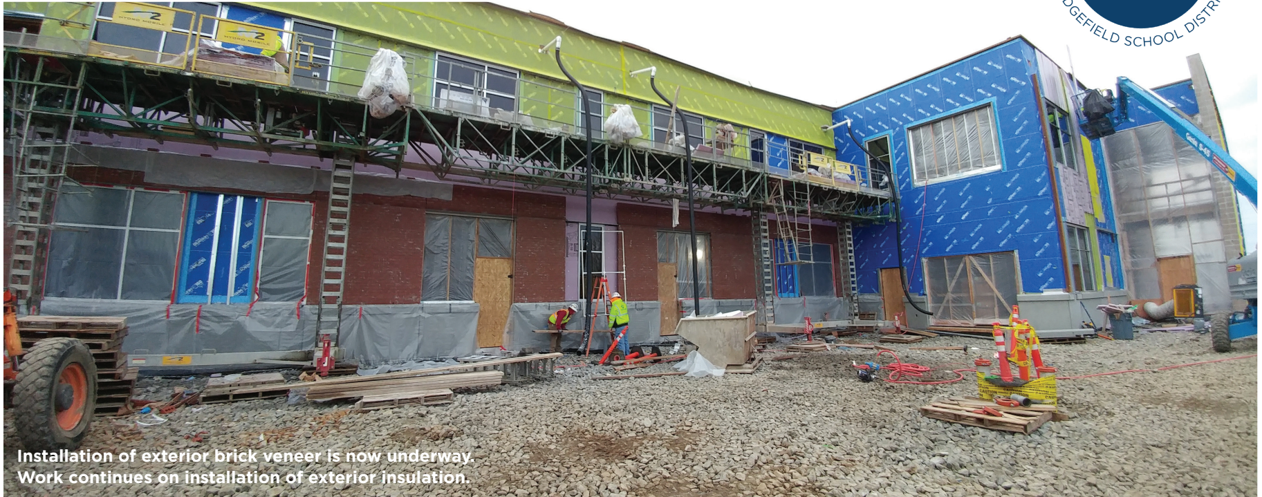
Installation of exterior brick veneer is now underway. Work continues on installation of exterior insulation.