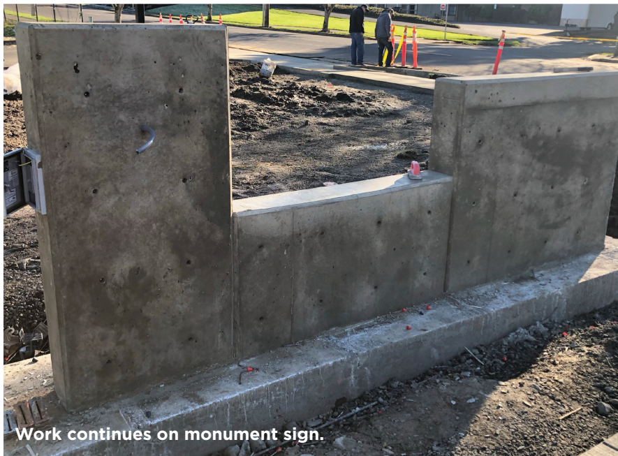
Work continues on monument sign.