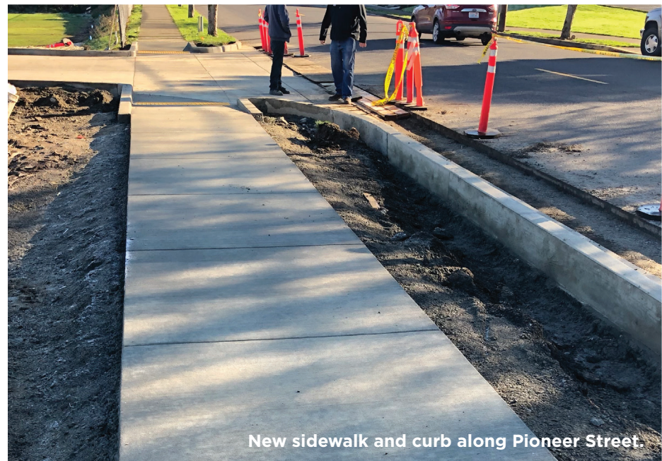
New sidewalk and curb along Pioneer Street.