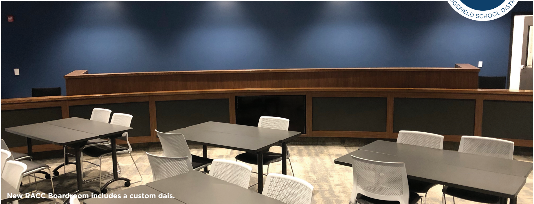
New RACC Boardroom includes a custom dais.