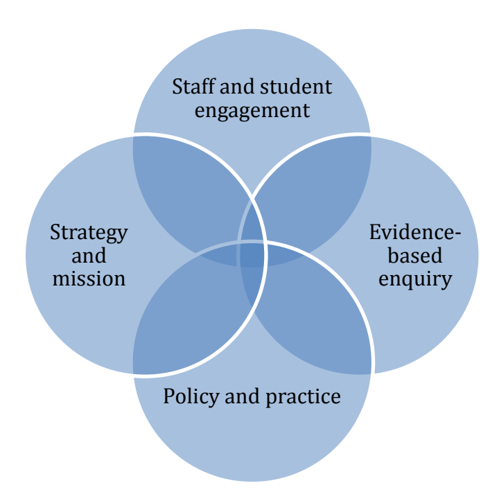
Figure 2: Key themes from the aims and objectives of the projects

In order to add detail to the four broad categories of project aims and objectives, this section briefly summarises the approaches taken. Some projects made proposals around strategy and overall culture such