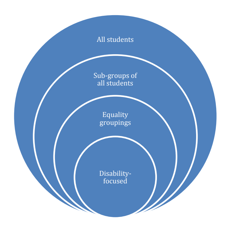
Figure 1: Inclusive learner groupings