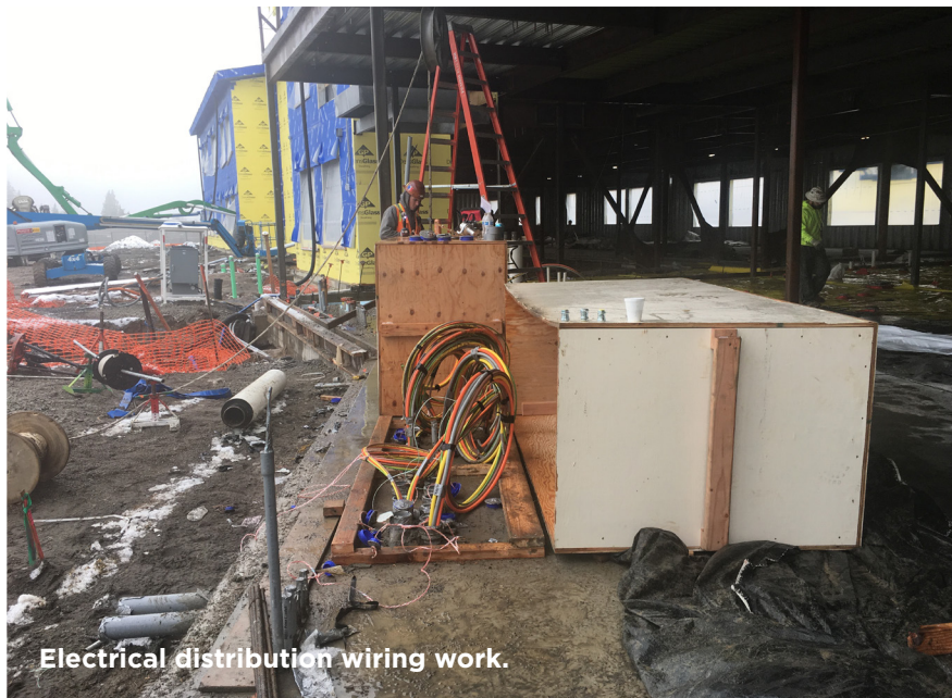
Electrical distribution wiring work.