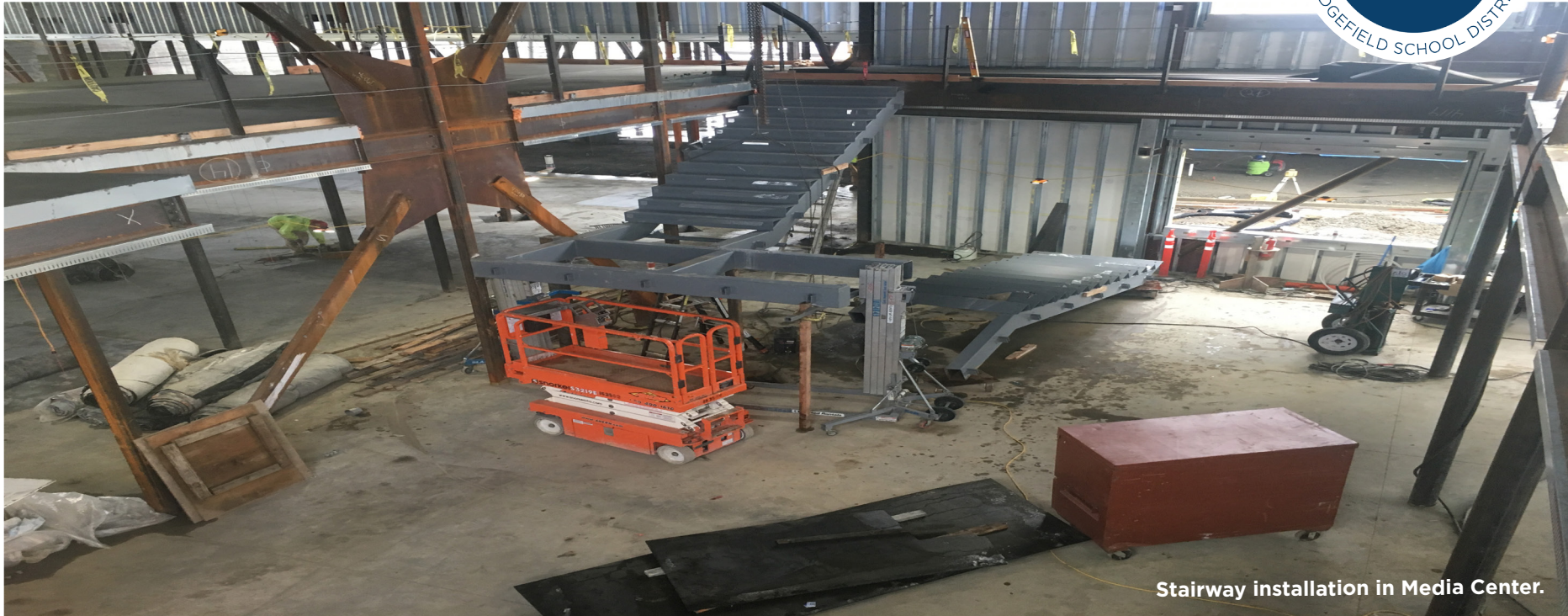
Stairway installation in Media Center.