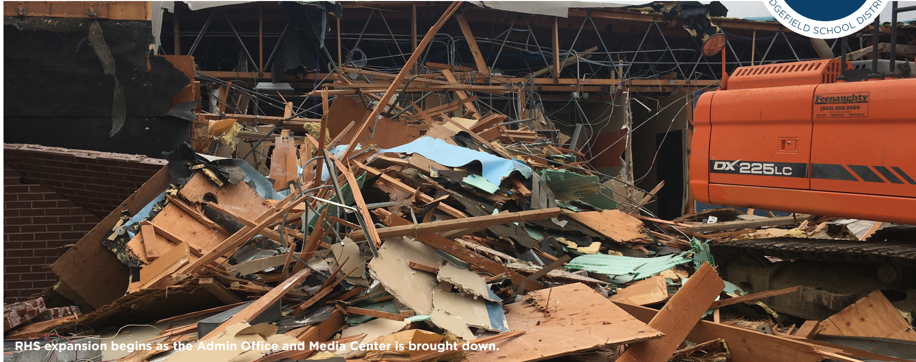
RHS expansion begins as the Admin Office and Media Center is brought down.