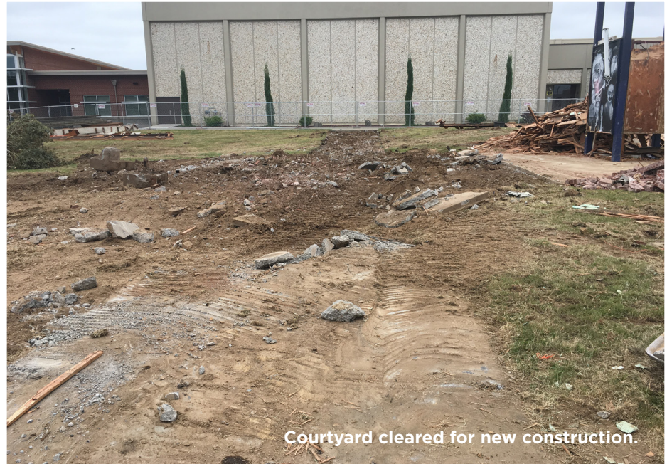
Courtyard cleared for new construction.