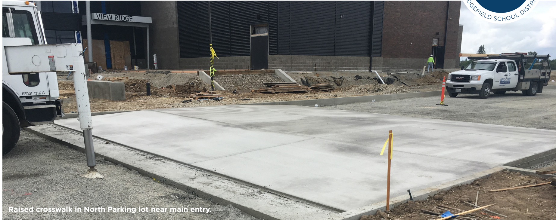
Raised crosswalk in North Parking lot near main entry.