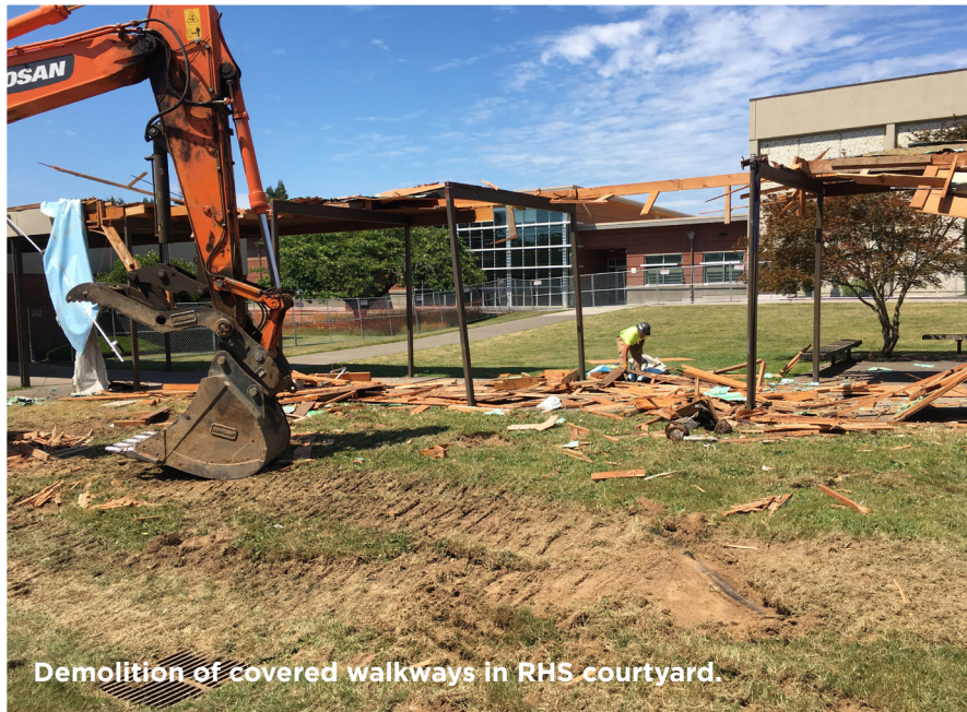
Demolition of covered walkways in RHS courtyard.