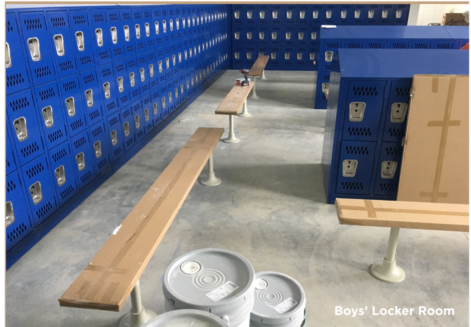
Boys' Locker Room