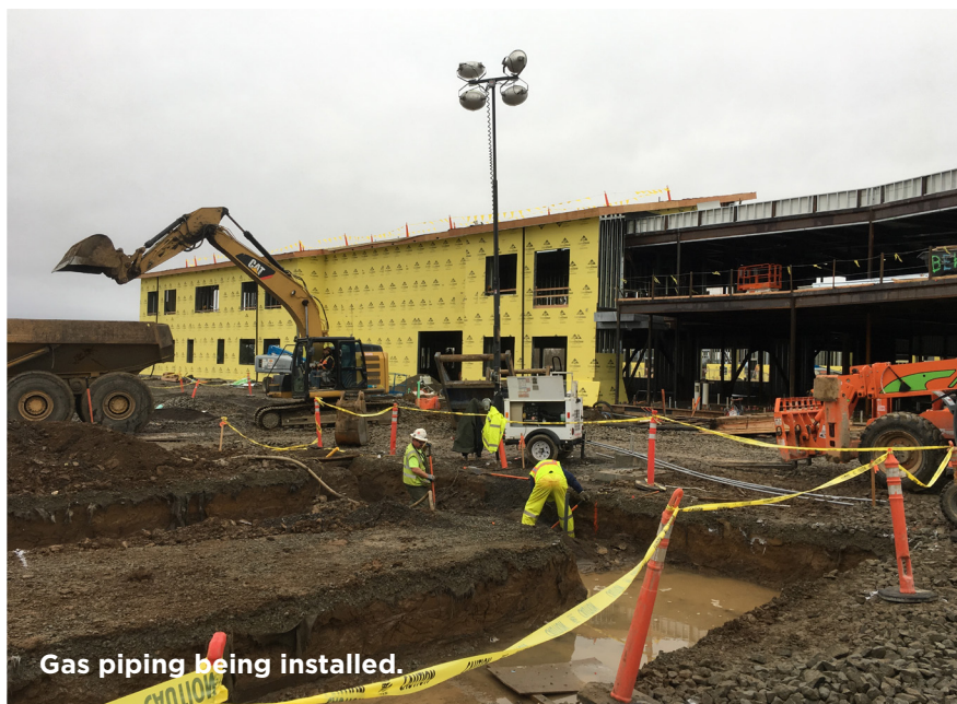
Gas piping being installed.