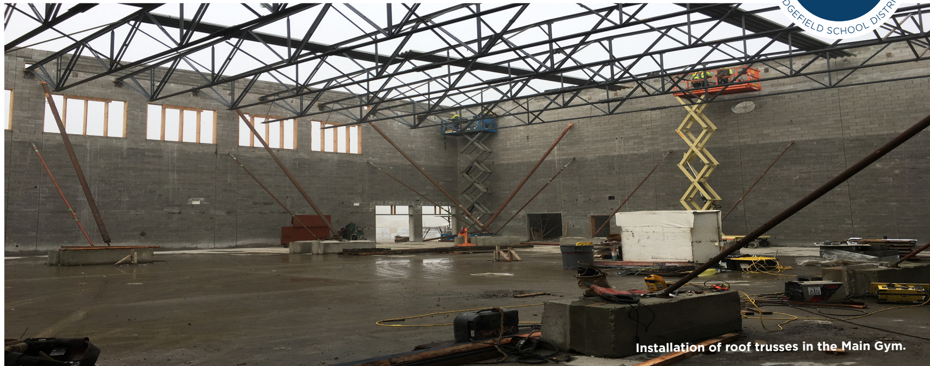
Installation of roof trusses in the Main Gym.