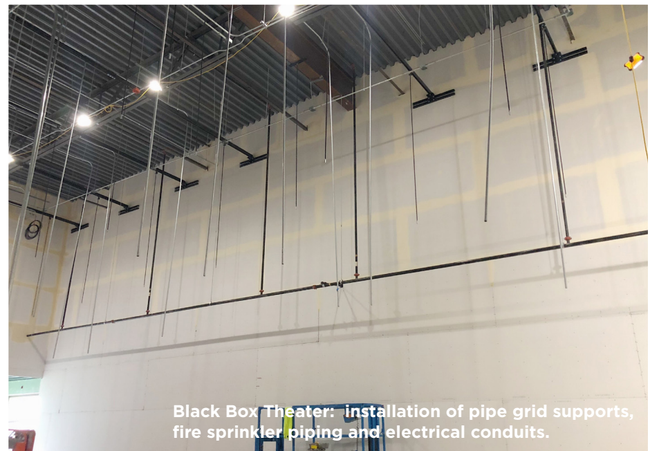
Black Box Theater: installation of pipe grid supports, fire sprinkler piping and electrical conduits.