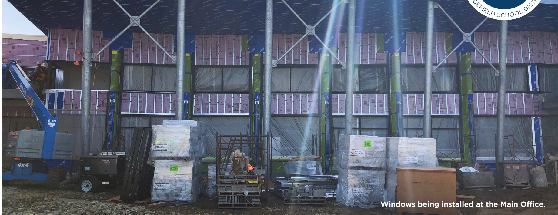
Windows being installed at the Main Office.