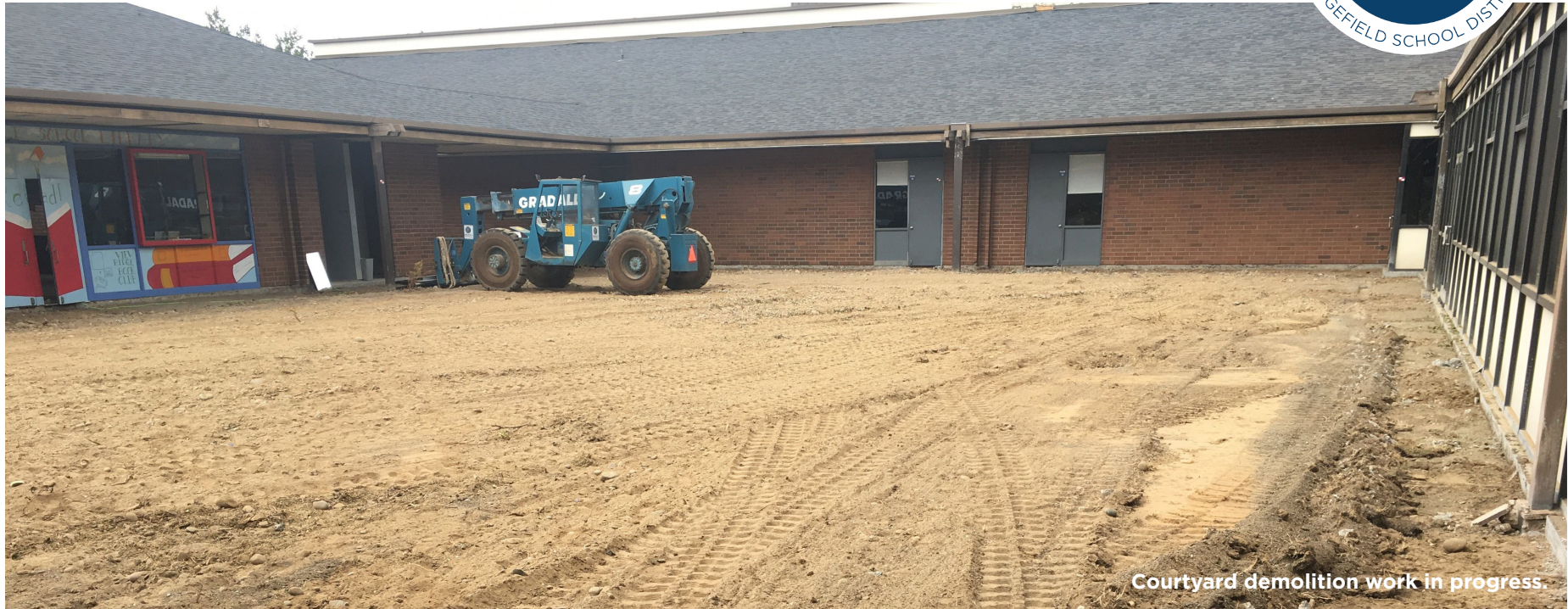
Courtyard demolition work in progress.