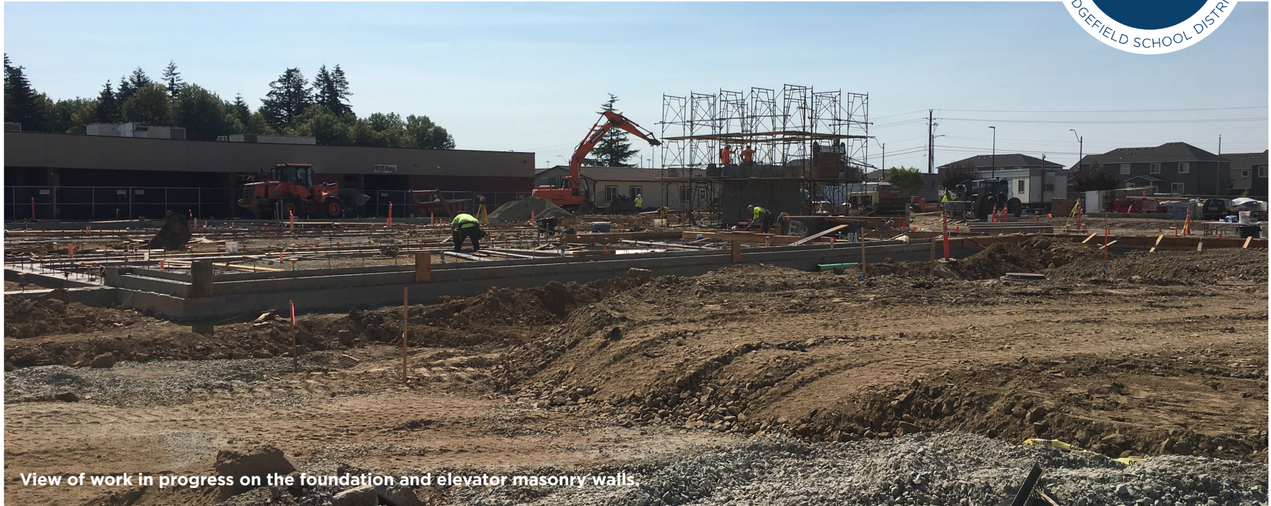
View of work in progress on the foundation and elevator masonry walls.