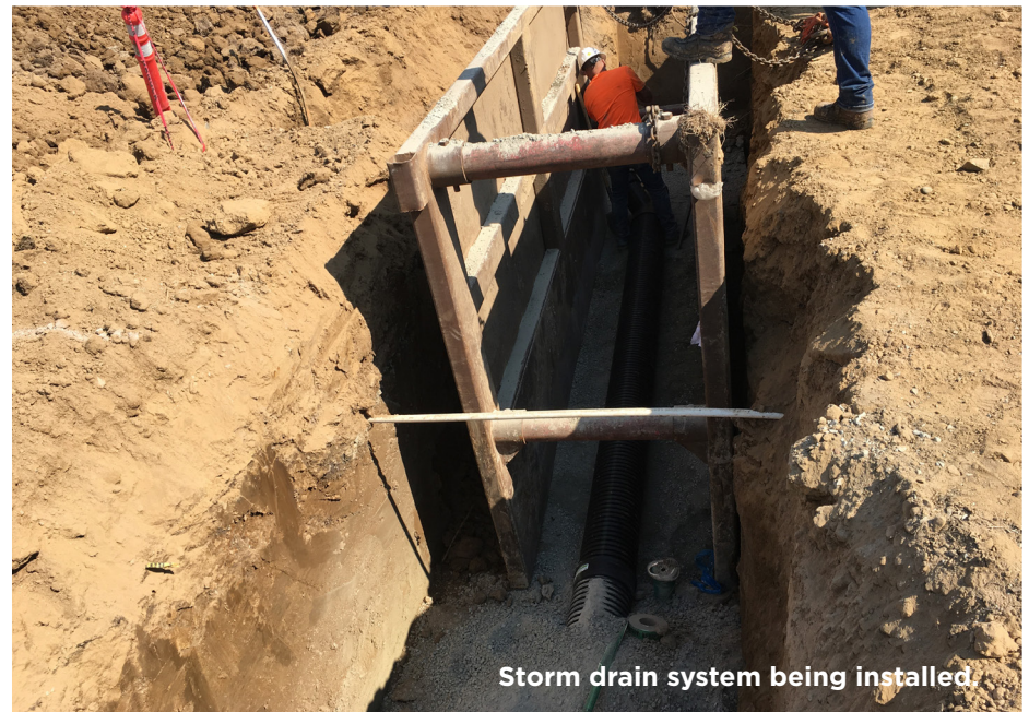
Storm drain system being installed.