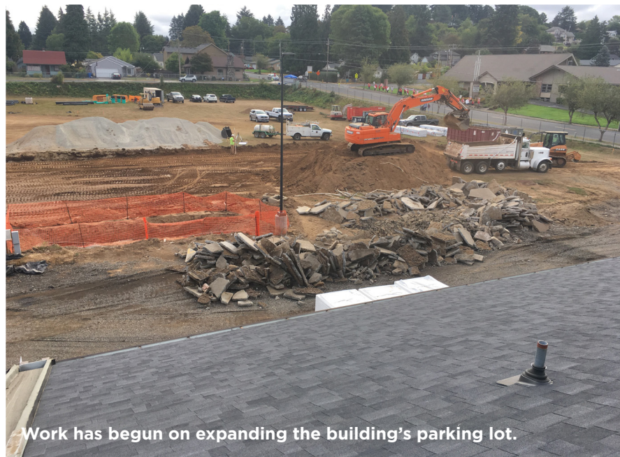
Work has begun on expanding the building's parking lot.