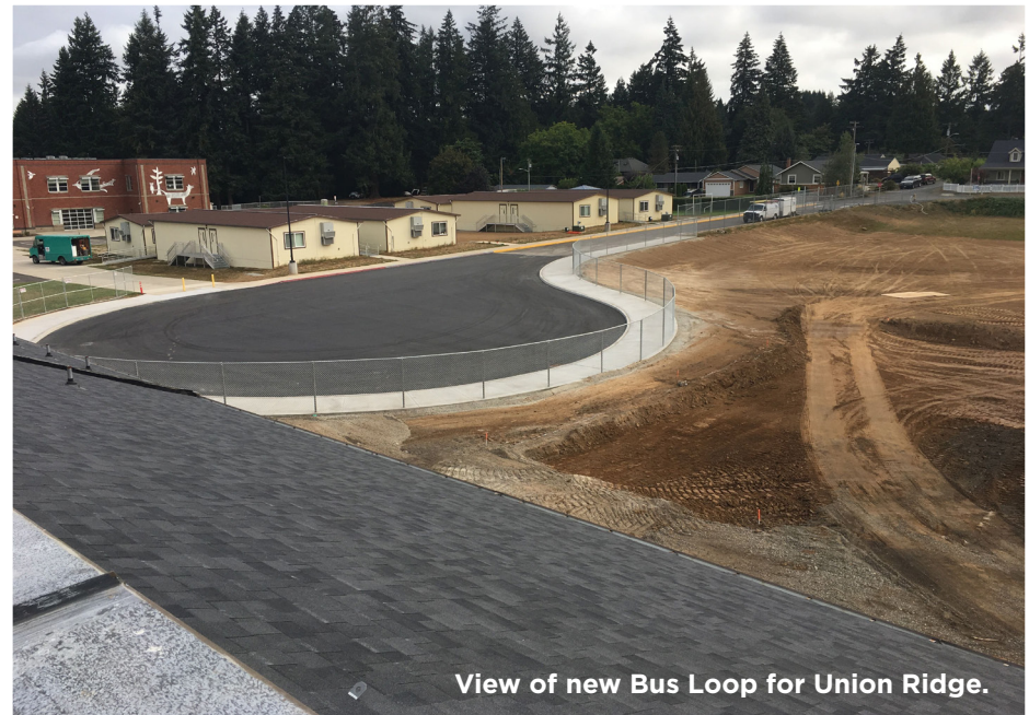
View of new Bus Loop for Union Ridge.