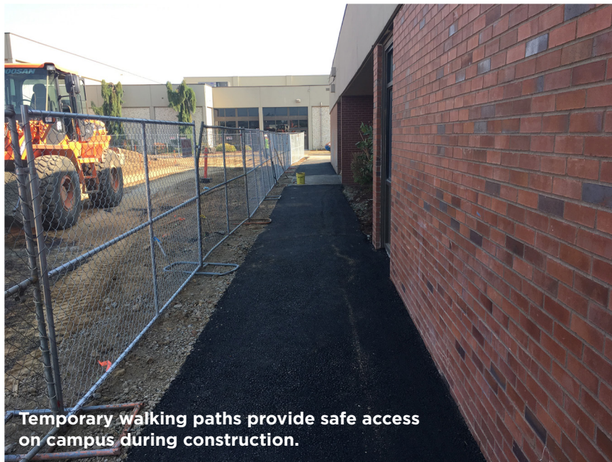
Temporary walking paths provide safe access on campus during construction.