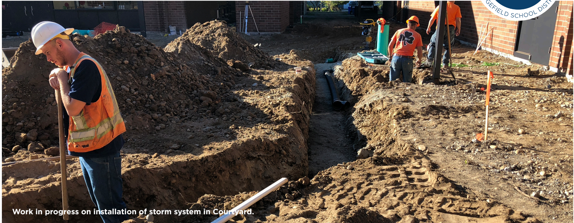
Work in progress on installation of storm system in Courtyard.