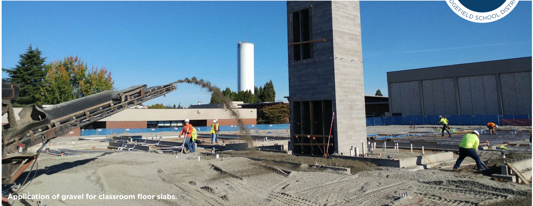
Application of gravel for classroom floor slabs.