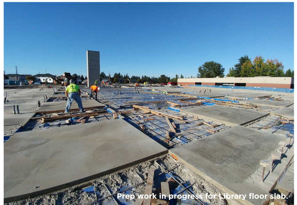
Prep work in progress for Library floor slab.