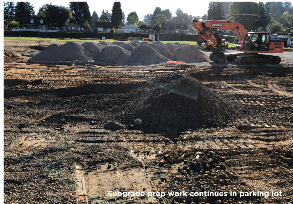
Subgrade prep work continues in parking lot.