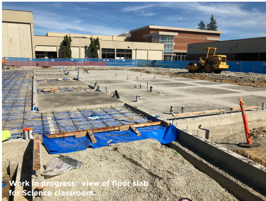
Work in progress: view of floor slab for Science classroom.