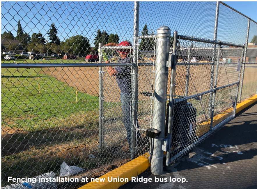
Fencing installation at new Union Ridge bus loop.