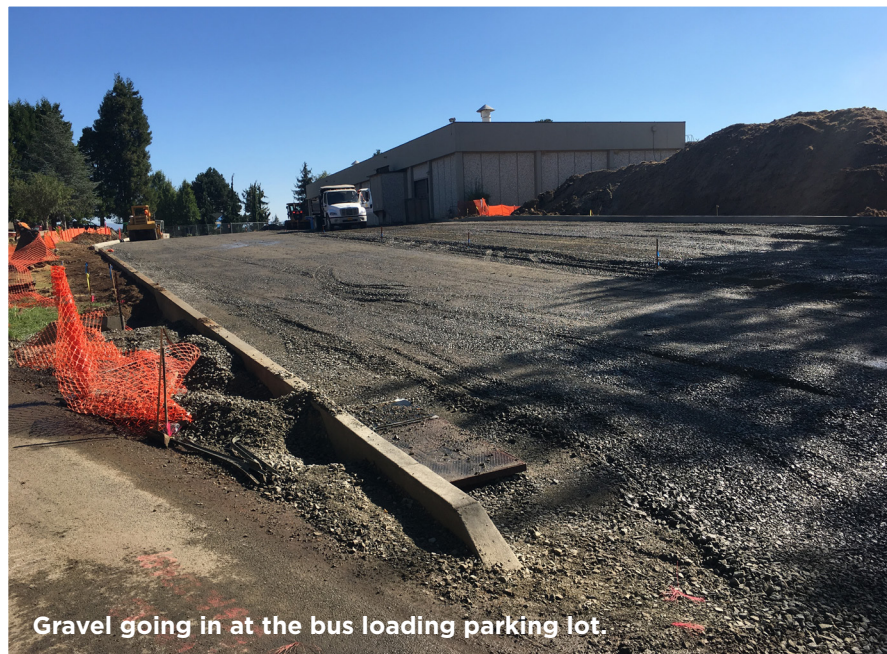
Gravel going in at the bus loading parking lot.