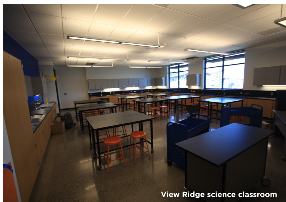
View Ridge science classroom