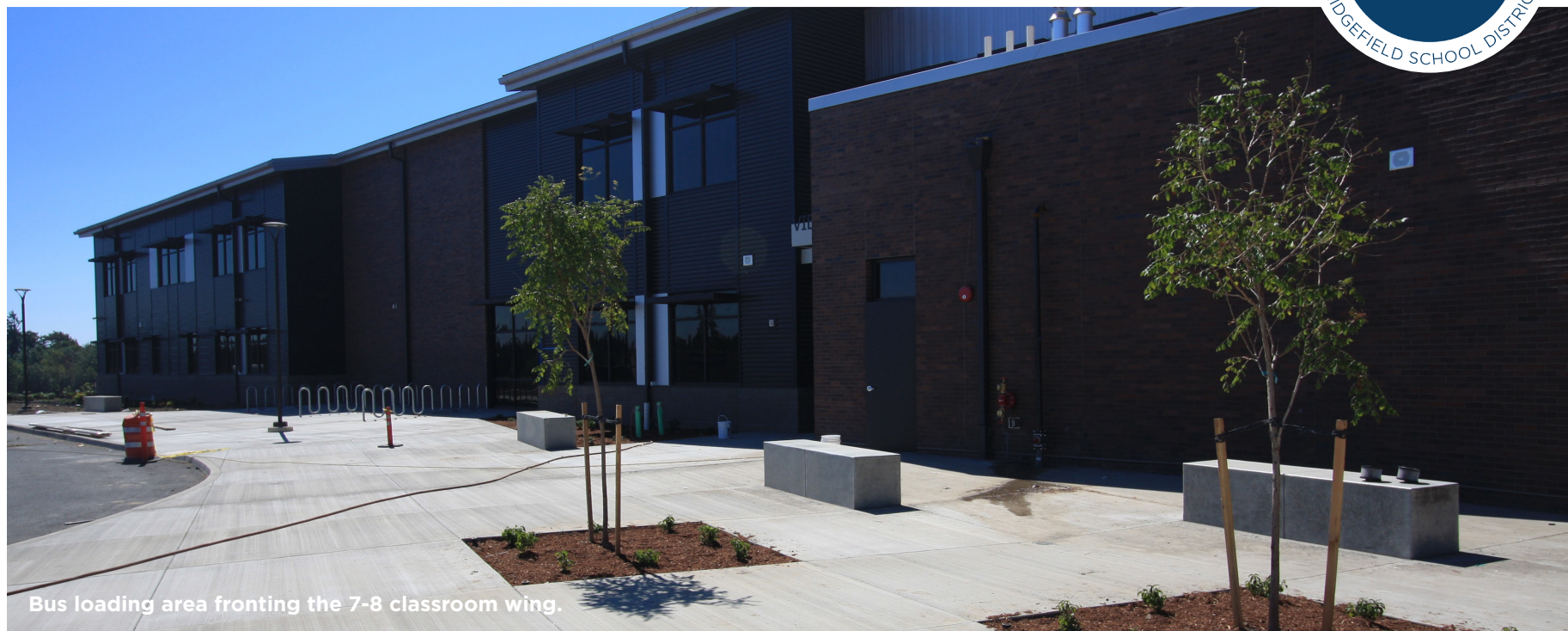
Bus loading area fronting the 7-8 classroom wing.