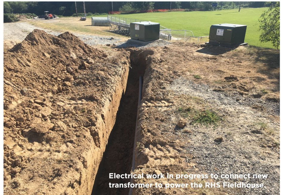
Electrical work in progress to connect new transformer to power the RHS Fieldhouse.