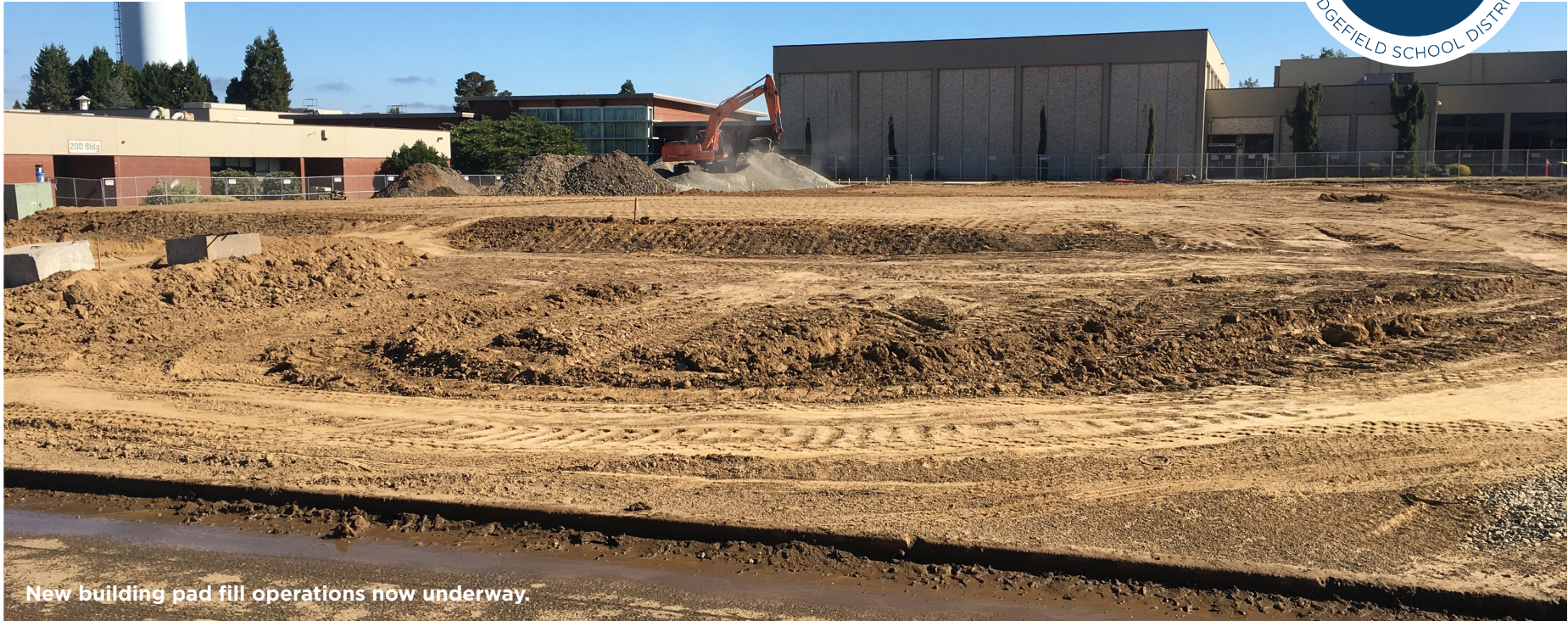
New building pad fill operations now underway.