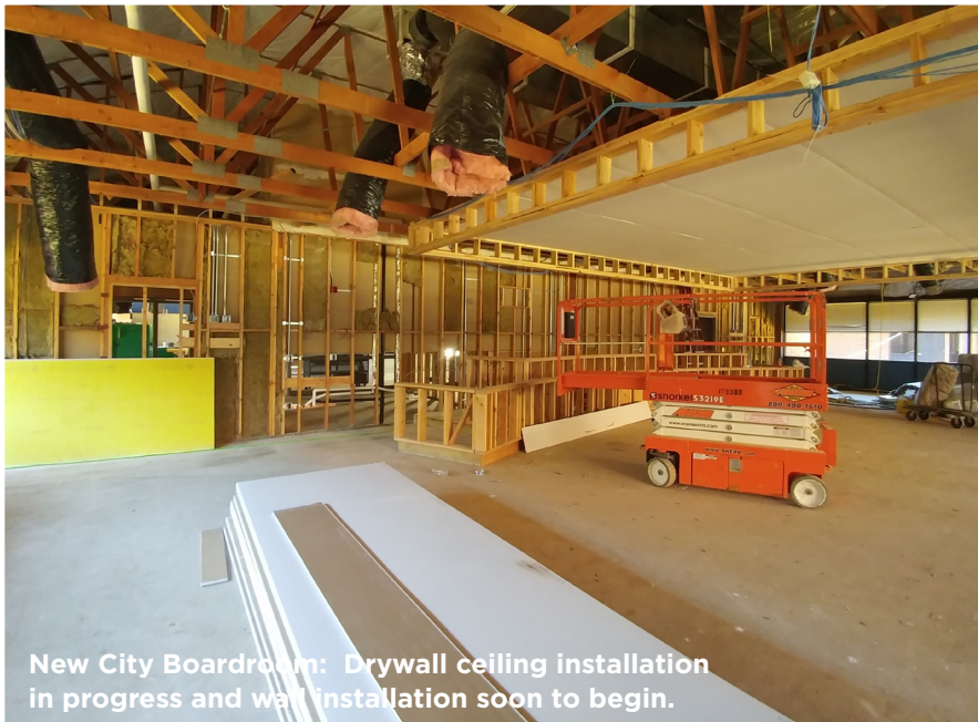
New City Boardroom: Drywall ceiling installation in progress and wall installation soon to begin.