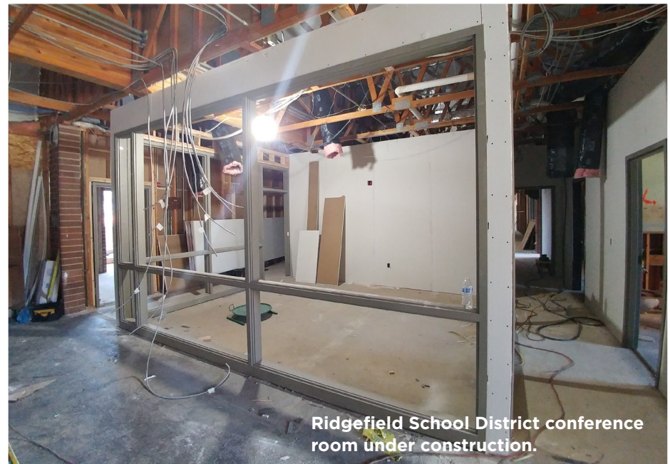
Ridgefield School District conference room under construction.