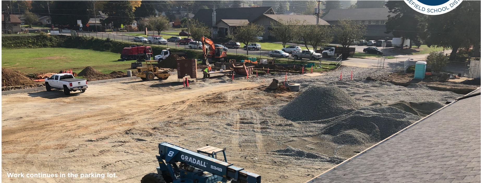
Work continues in the parking lot.