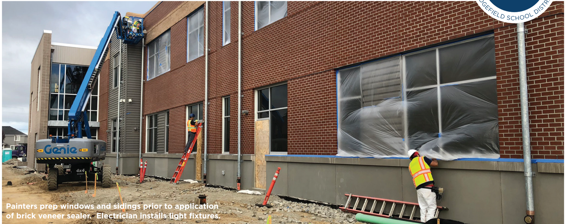
Painters prep windows and sidings prior to application of brick veneer sealer. Electrician installs light fixtures.