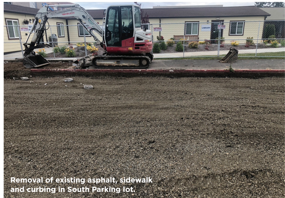
Removal of existing asphalt, sidewalk and curbing in South Parking lot.