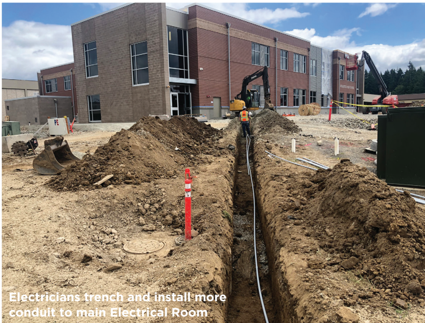
Electricians trench and install more conduit to main Electrical Room