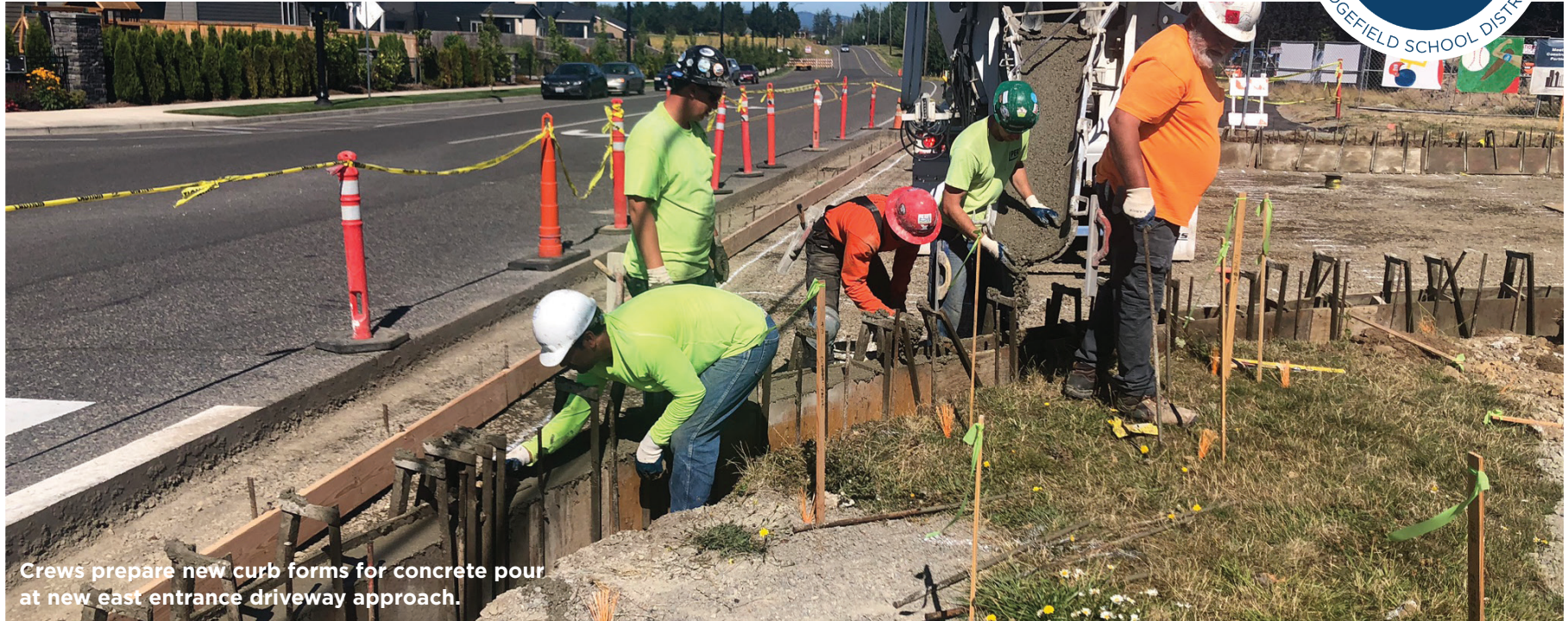
Crews prepare new curb forms for concrete pour at new east entrance driveway approach.