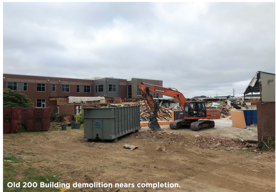
Old 200 Building demolition nears completion.