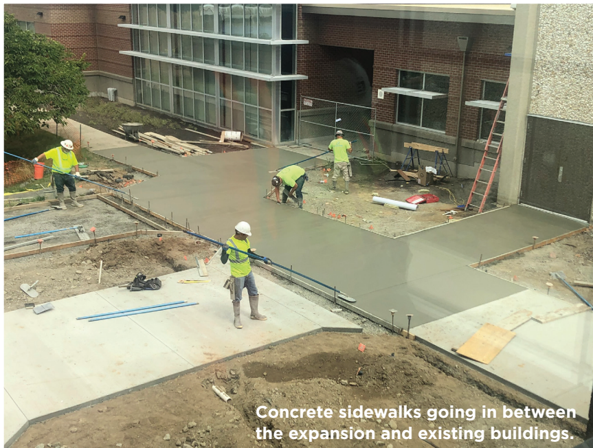
Concrete sidewalks going in between the expansion and existing buildings.