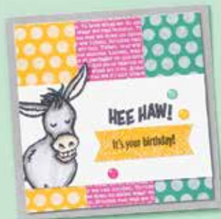
AC P. 143 A4 CARDSTOCK O Whisper White • 106549 11,75 € | £9.00