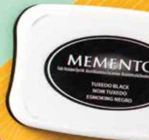
AC P. 147 MENTO™ INK PAD 132708 7,50 € | £5.50