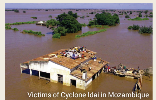
Victims of Cyclone Idai in Mozambique

On March 14th Cyclone Idai hit Mozambique and other Southern African countries including Zimbabwe and Malawi. The scale of the destruction is vast and over 500 people have lost their lives, with the death toll still rising due to the outbreak of cholera. Many homes have been destroyed with 90,000 people in temporary shelter in Mozambique alone, while many farmers have lost crops and livestock.