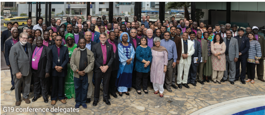
G19 conference delegates

From 25th February to 1st March, 138 delegates, including 4 Primates and 31 bishops and archbishops, gathered in Dubai for 'G19'. The conference was designed for those who had been unable to attend Gafcon 2018 in Jerusalem for political reasons and many came from contexts where there are severe restrictions on Christian witness.