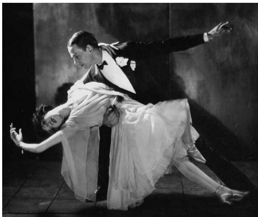
Figure 1.23: Now you're programming with style! (Fred Astaire and his sister Adele cutting a rug in 1921.)

https://www.youtube.com/watch?v=gaI6kBVyu0o