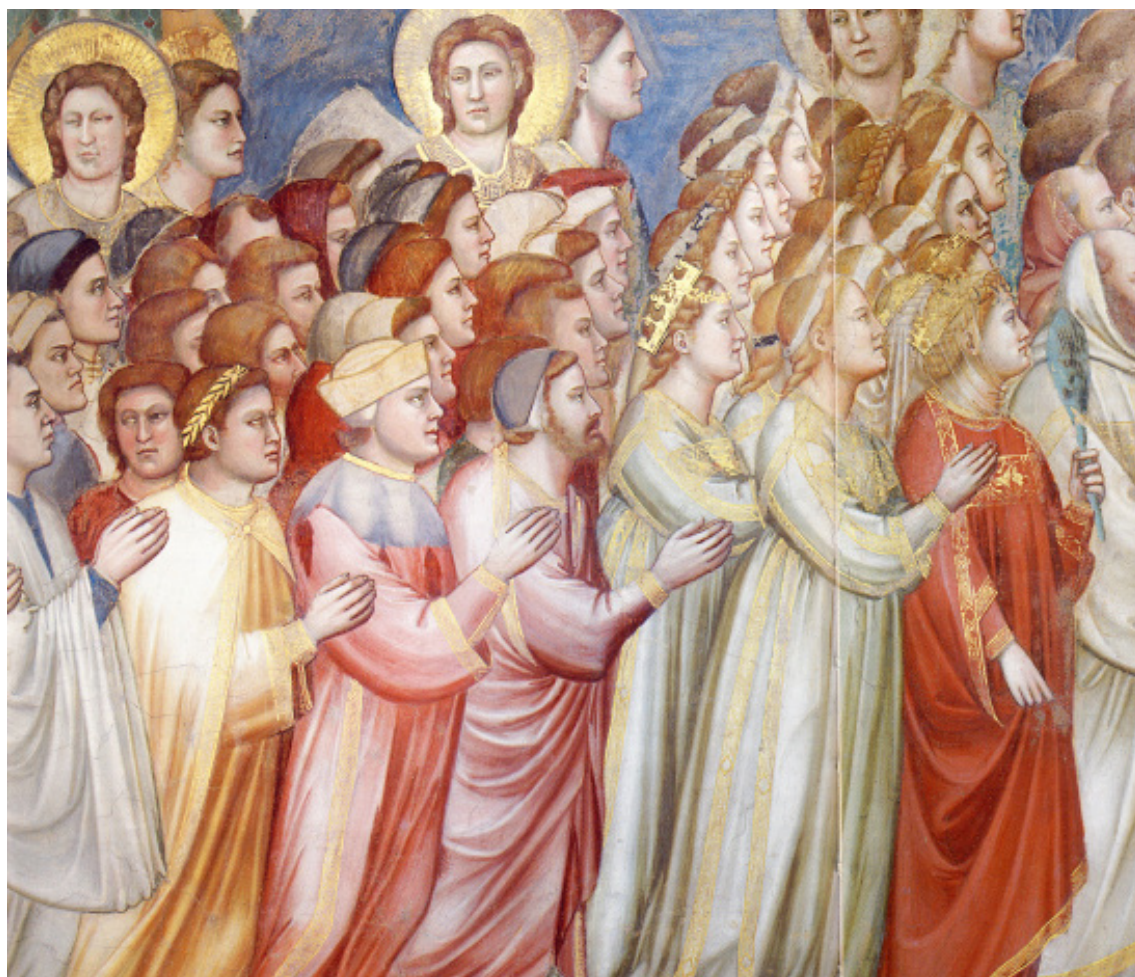
A fresco from the Scrovegni Chapel in Padua, Giotto