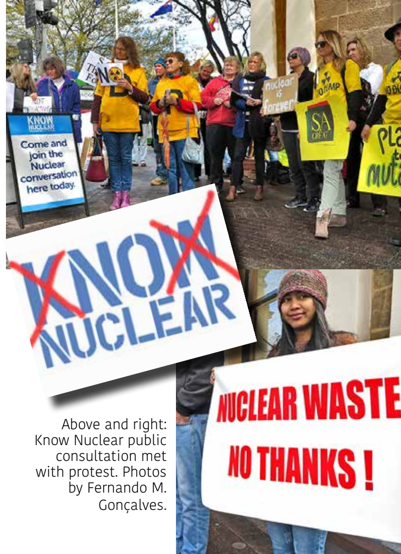
Above and right: Know Nuclear public consultation met with protest.

The CARA team closed their doors in March 2017. But while the 'Know Nuclear' push is off the streets, information remains online at: nuclear.yoursay.sa.gov.au/know-nuclear .