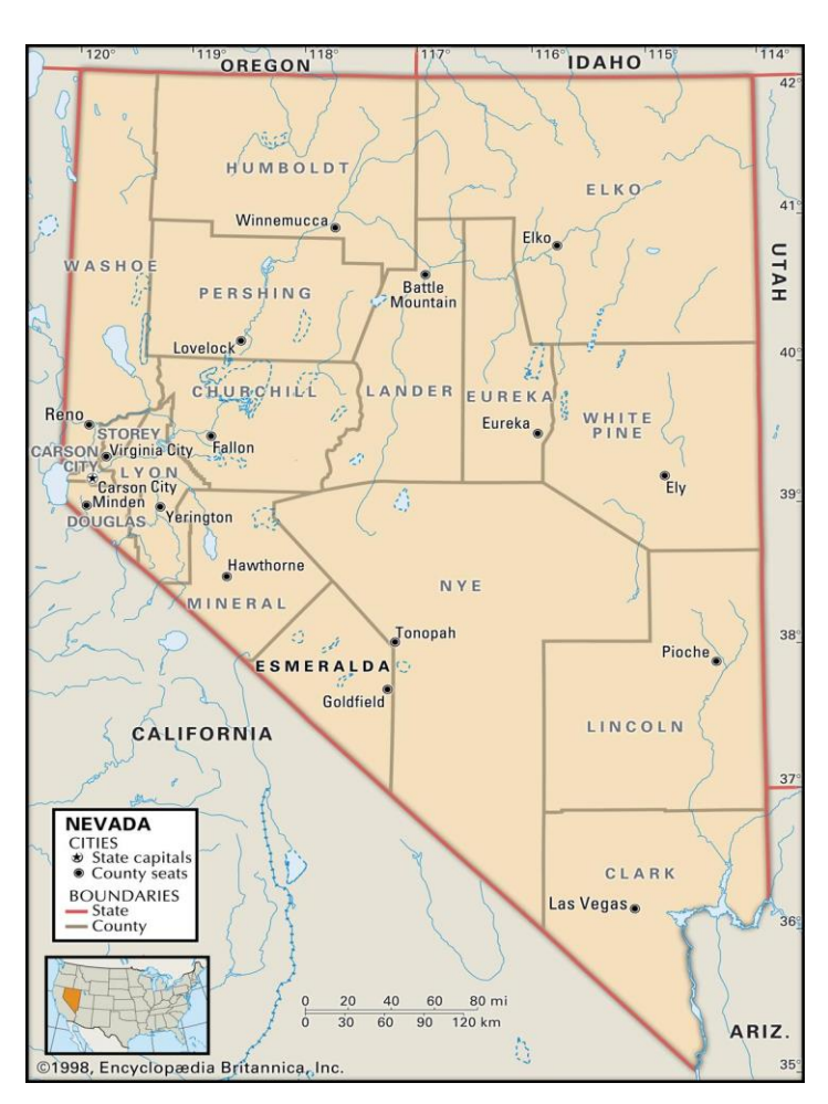
Map courtesy of Encyclopaedia Britannica, Inc., copyright 1998; used with permission.