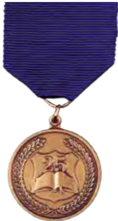
Missions Bible Memory Medal (Bronze)

Service Stars (p. 6) are awarded for completion of these requirements in subsequent years.