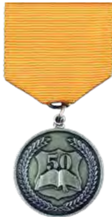
Missions Bible Memory Medal (Silver)