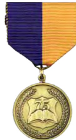
Missions Bible Memory Medal (Gold)