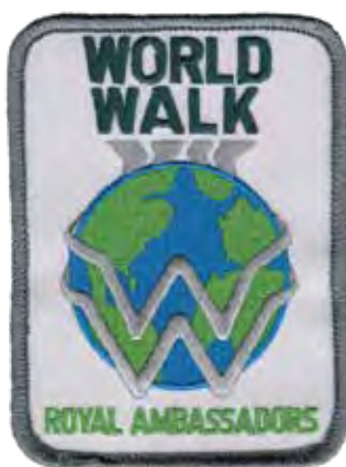
World Walk Patch

These patches are awarded to those who participate in the annual mission studies or mission action. Boys earn the patch the first year and are awarded a Year Patch (p. 8) in subsequent years.