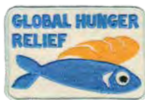
Global Hunger Relief Patch

Awarding Criteria: Participate in a combination of study and relief projects