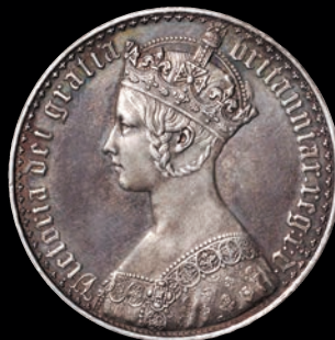
Victoria Gothic crown