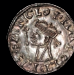
Harold II PAXS Penny