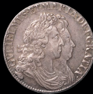
William & Mary crown Ex Slancy