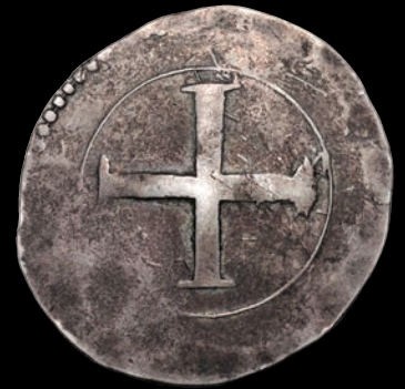
Confederate Catholics crown

We have handled headline rarities, modest accumulations, and thousands of coins, tokens, medals, and miscellany that fall in between.