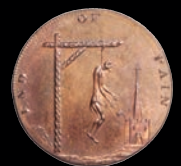
Spence - End of Pain