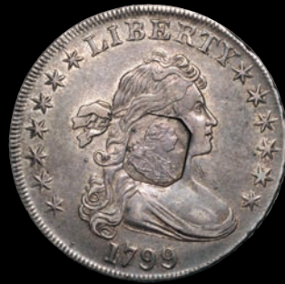
George III c/m on U.S. 1799 dollar Ex Norweb