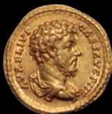
Marcus Aurelius aureus