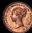
Victoria half farthing