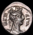
Hosidia - Calydonian boar