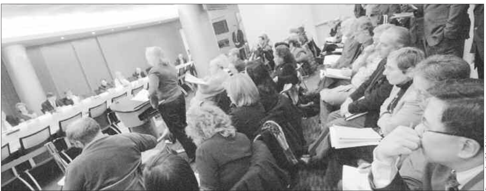
At the January 22 hearing on CUNY policy changes, those waiting to testify were crammed behind a barrier at one end of the room. They faced administration representatives across a wide gulf.