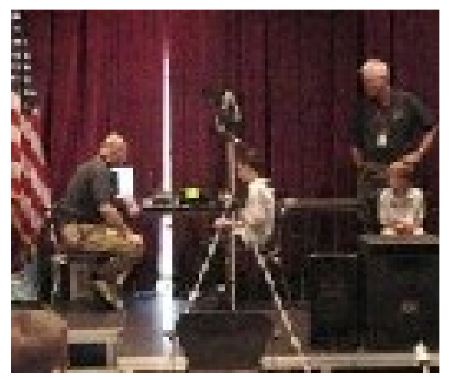
Ham volunteers make Upper St. Clair's ARISS a success!