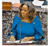
Delegate Stacey Plaskett of the U.S. Virgin Islands at the trial.