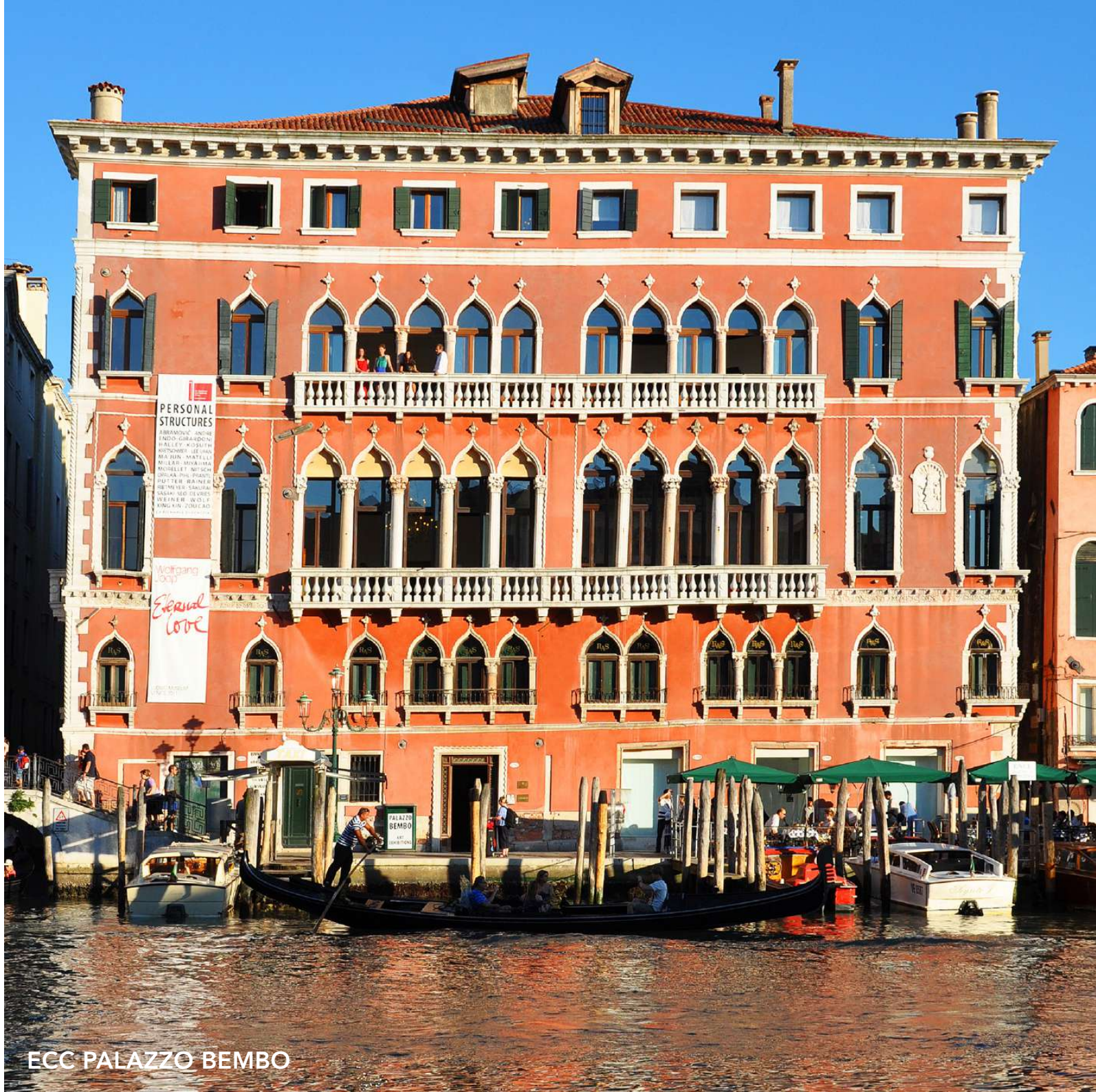
ECC PALAZZO BEMBO