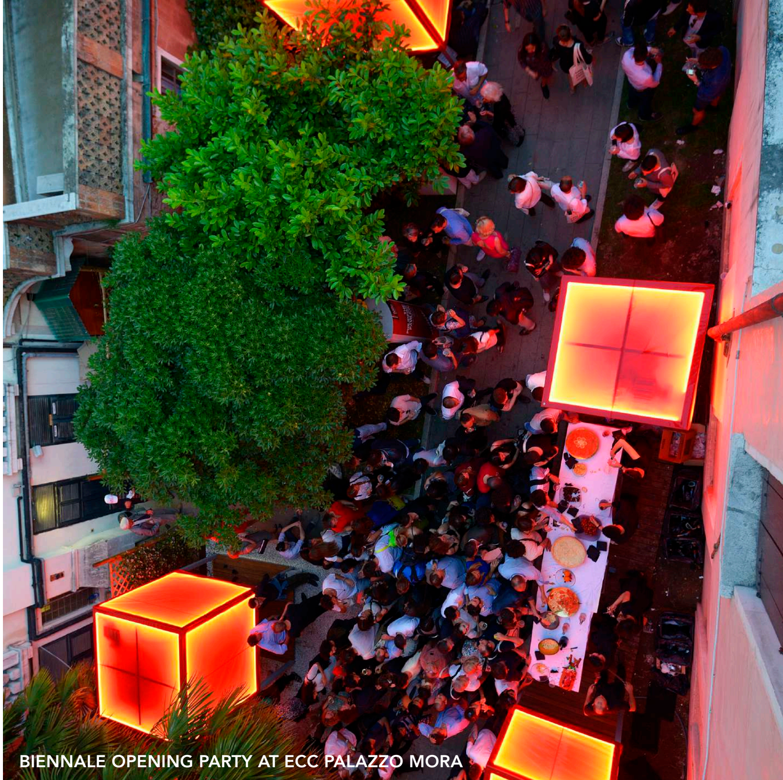
BIENNALE OPENING PARTY AT ECC PALAZZO MORA