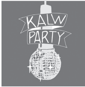
Designed by Cal Tabuena-Frolli

During the party, there was more auspicious news – our hosts at CCSF got word