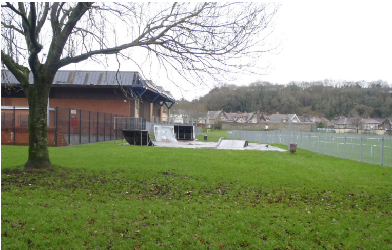
Views of the current Skate park which is located behind the leisure centre