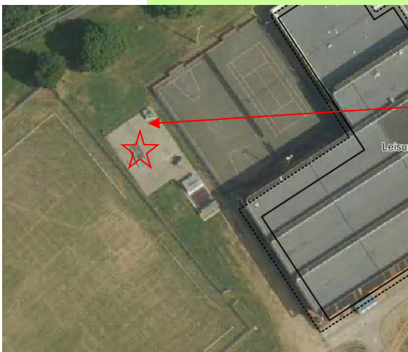
Aerial photograph indicating the extent of the current skate park