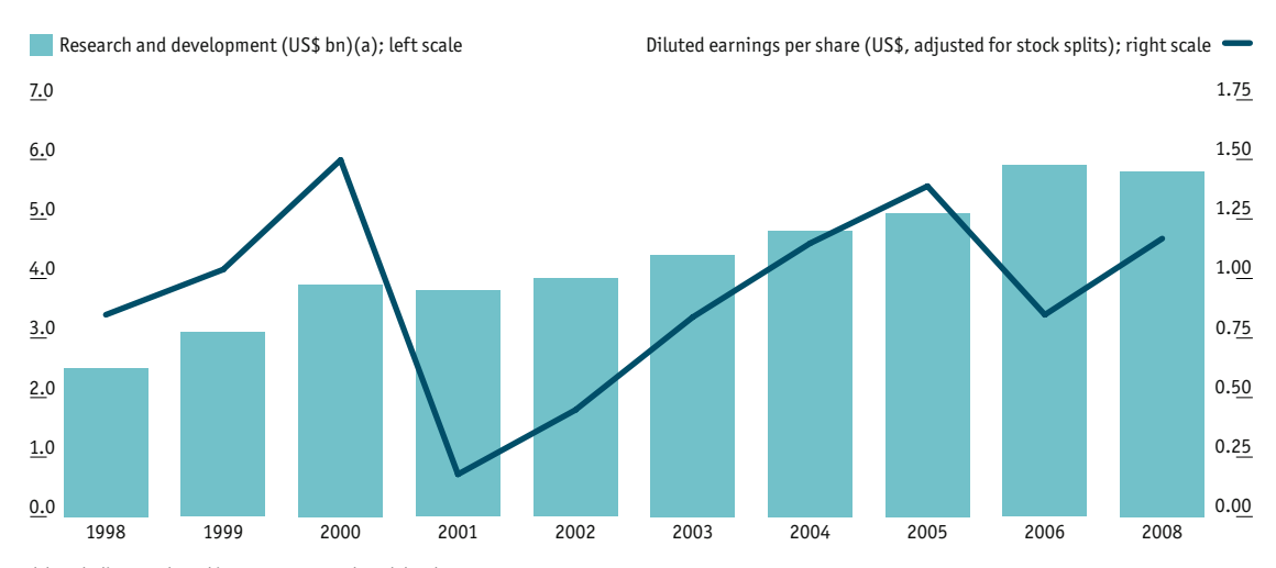
(a) Excluding purchased in-process research and development.