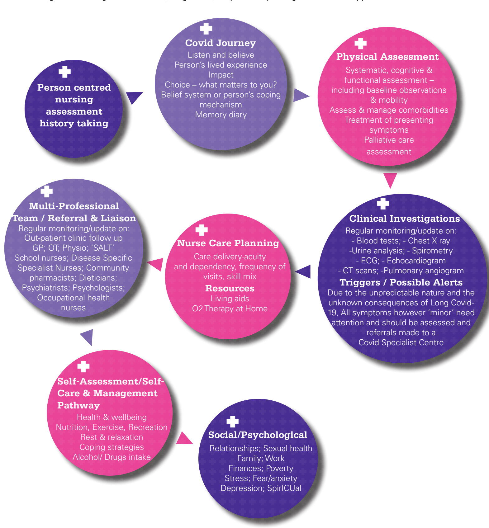
Figure 2 – Living with Covid-19 (Long Covid) Physical/ Psychological/ Social - Support

'Some have reported 'floating' symptoms whereby they suffer an illness linked to one part of the body such as the respiratory system, the brain, cardiovascular system and heart, the kidneys, the gut, the liver or skin – which later abates only for new symptoms to arise in a different part of the body.'