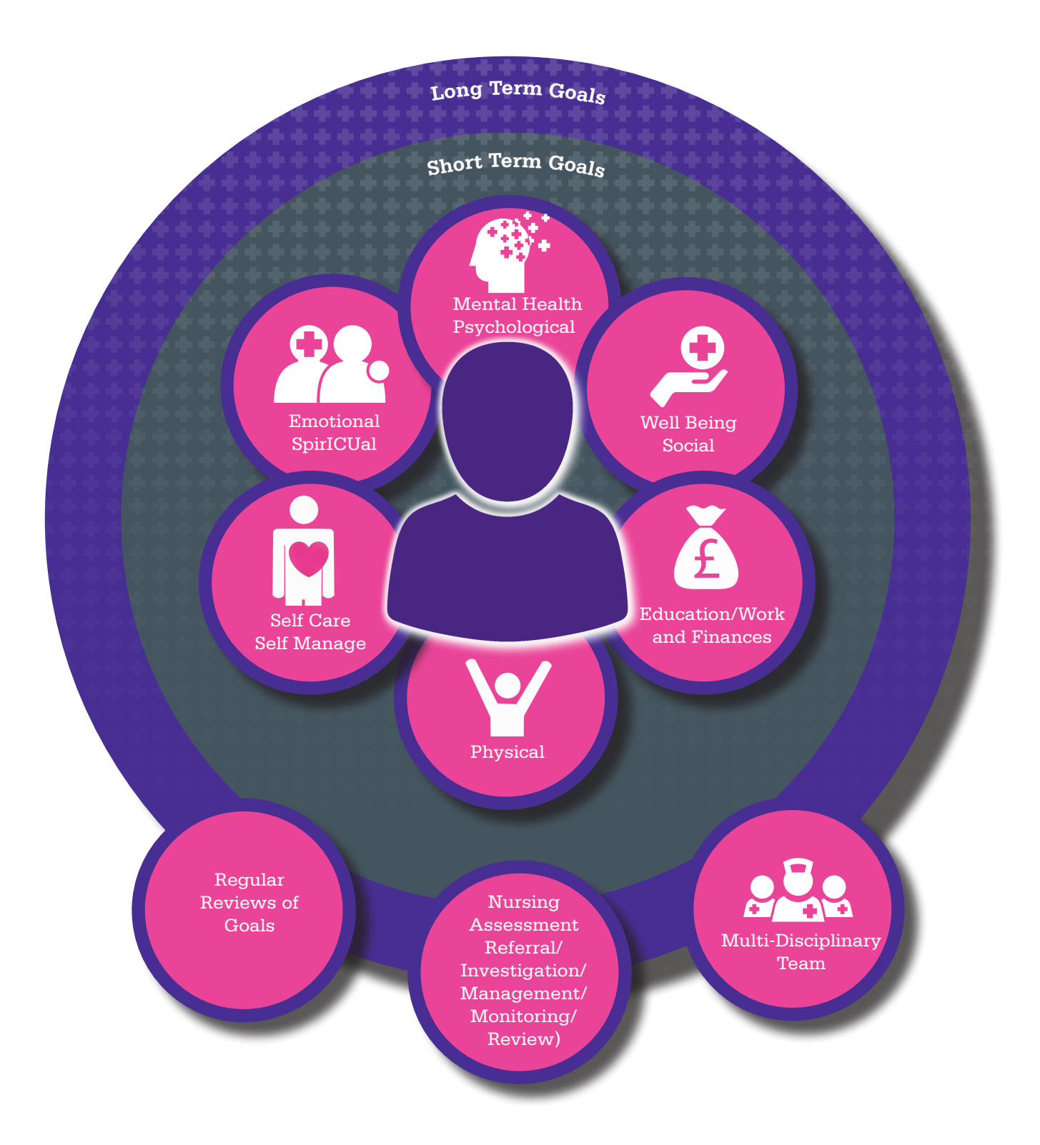
Figure 1. Living with Covid-19 (Long Covid) and Beyond Community and Primary Care Nursing Resource