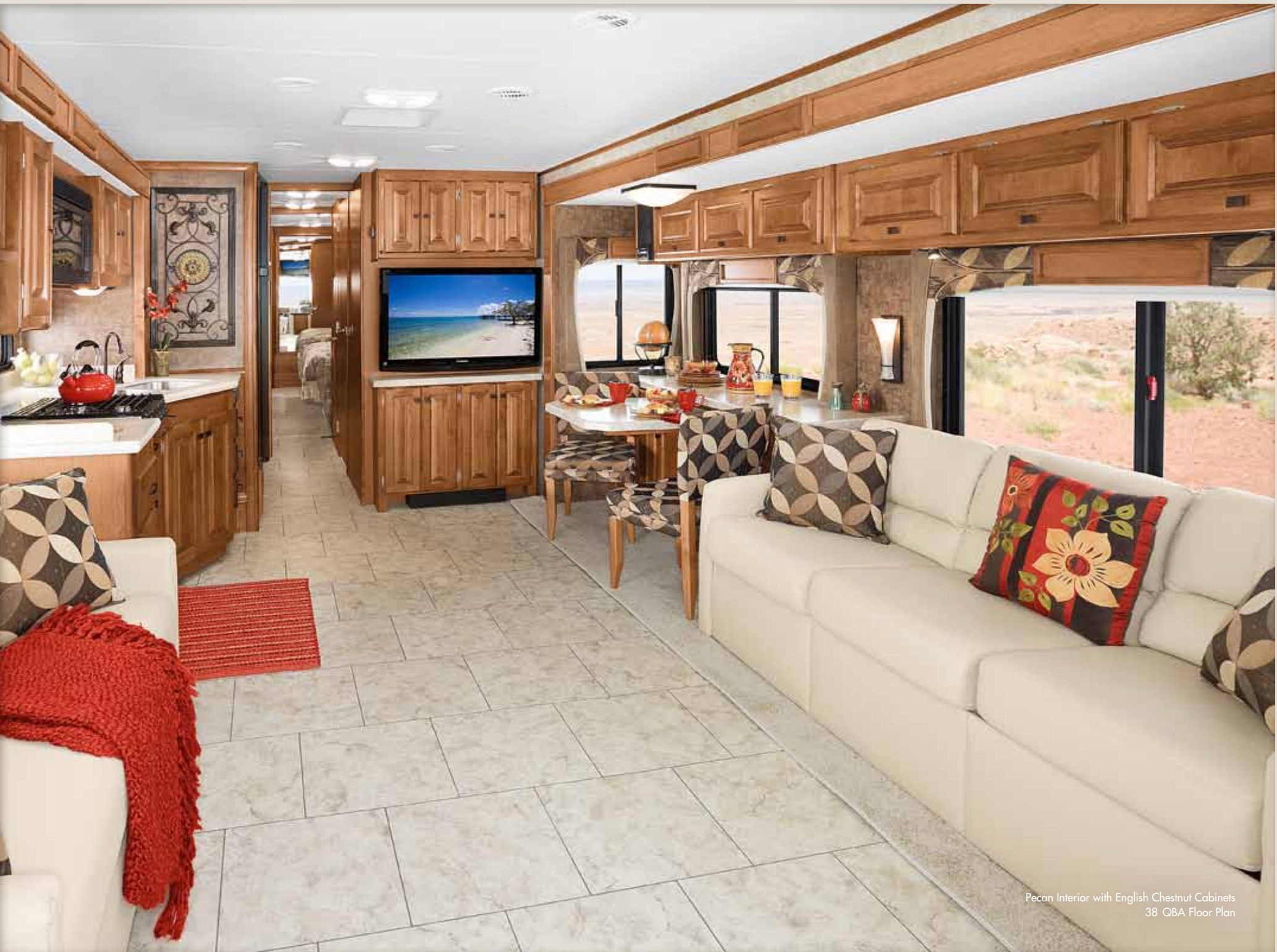
Pecan Interior with English Chestnut Cabinets 38 QBA Floor Plan