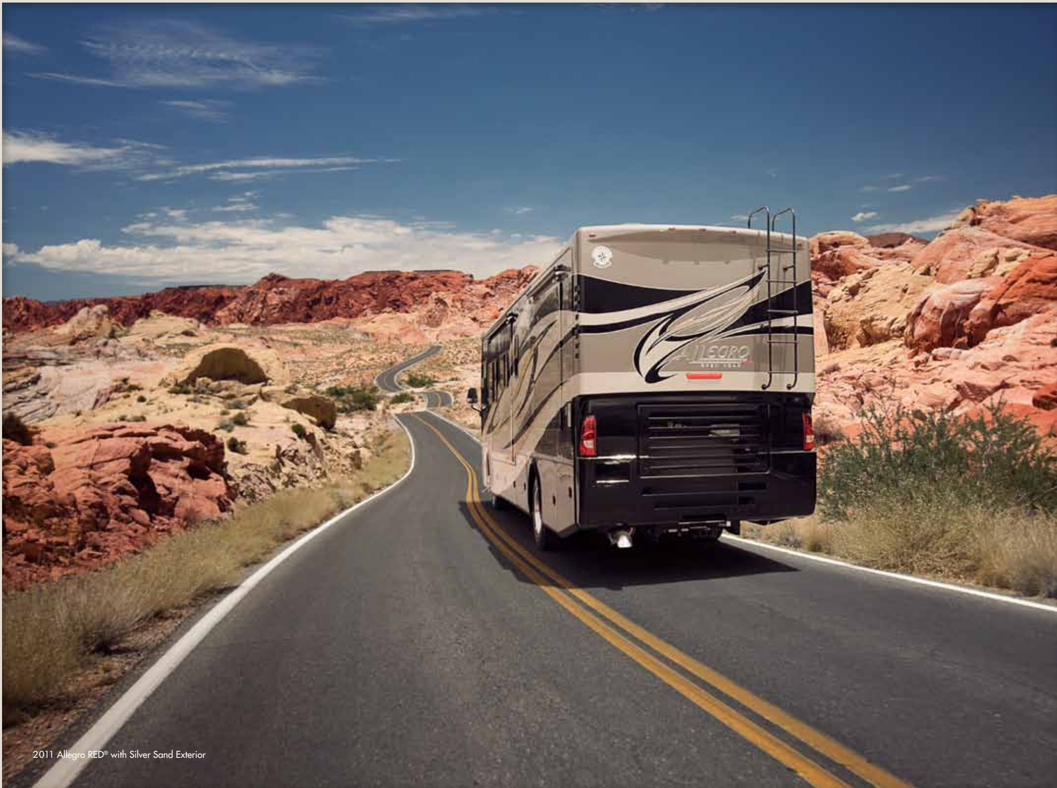
2011 Allegro RED® with Silver Sand Exterior