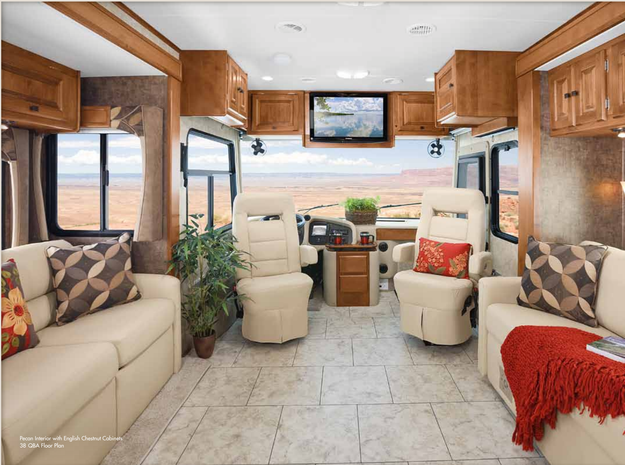
Pecan Interior with English Chestnut Cabinets 38 QBA Floor Plan