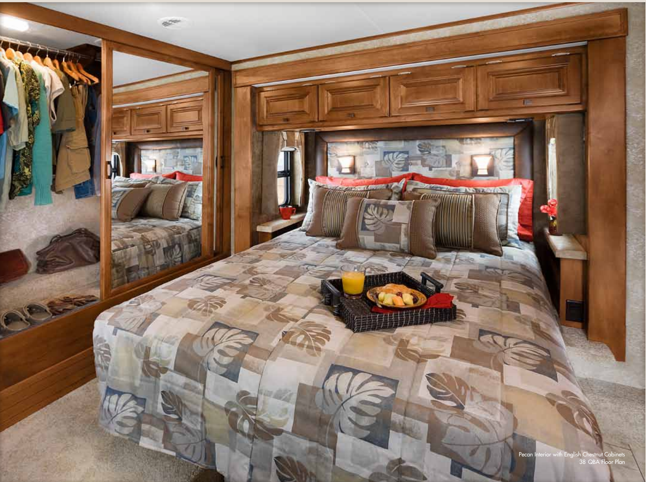
Pecan Interior with English Chestnut Cabinets 38 QBA Floor Plan